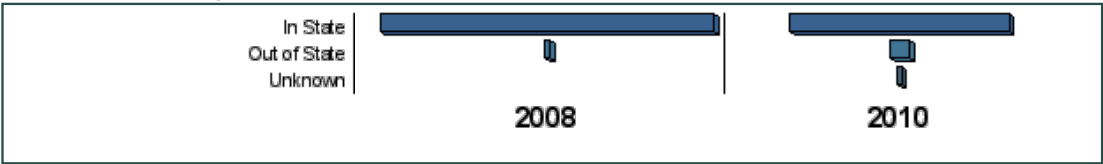
FIGURE C: In State/Out of State Trends