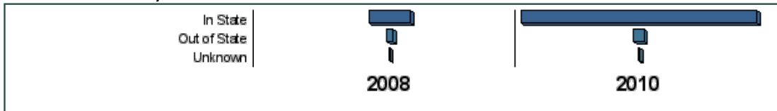
FIGURE C: In State/Out of State Trends